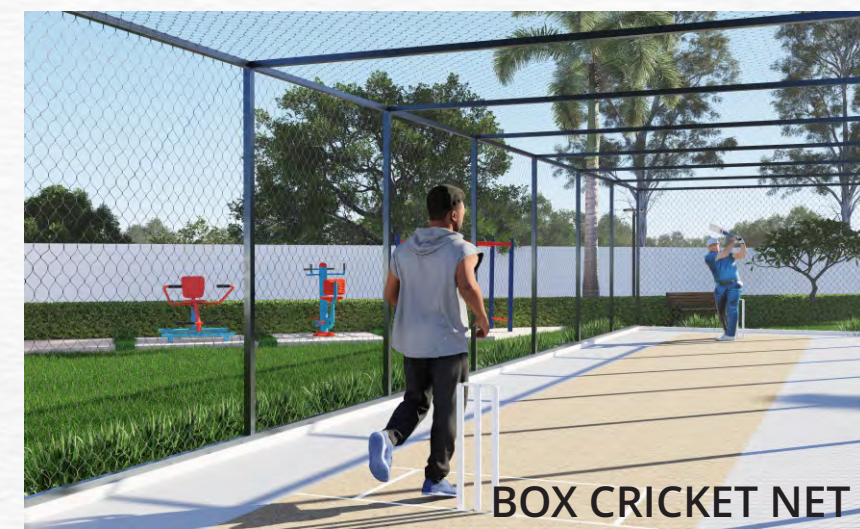
BOX CRICKET NET